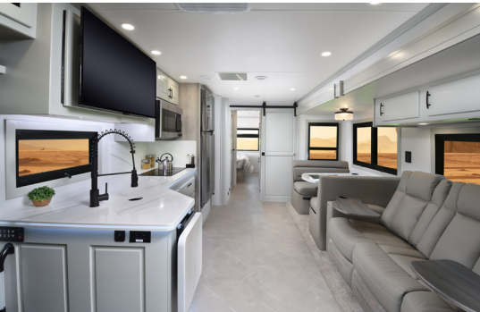
34KD shown with Mindful Gray cabinetry and Milano II décor.