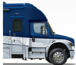
Aerodynamic Front Cap with Cab-Over Cabinets