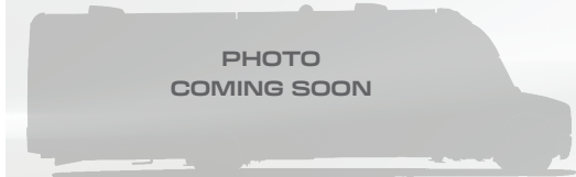
PHOTO COMING SOON