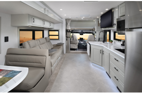
34KD shown with Mindful Gray cabinetry and Milano II décor.