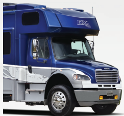
Extended Front Cap with Cab-Over Bunk