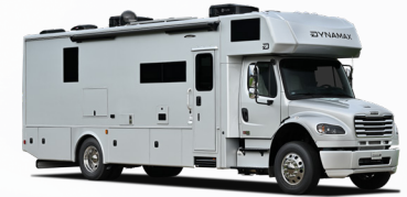
Platinum (Single Color Full Body Paint)