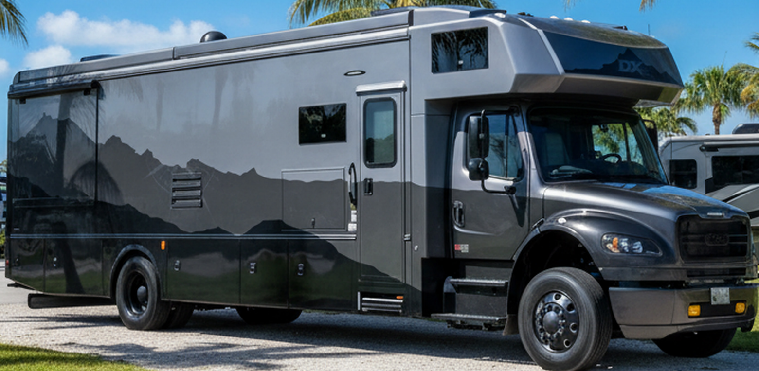
Pictured with Optional Extended Front Cap with Cab-Over-Bunk and Optional Blackout Package