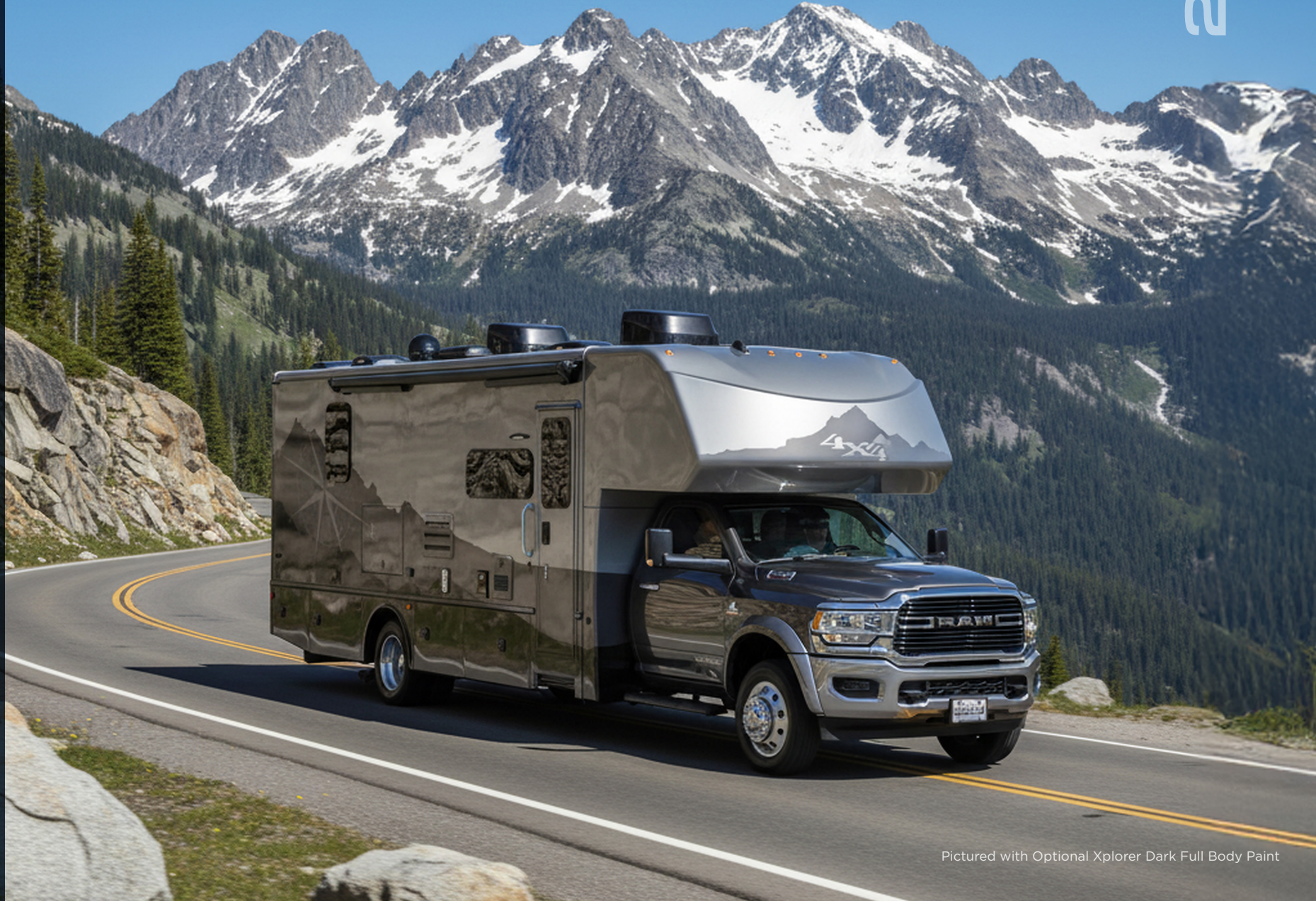
Pictured with Optional Xplorer Dark Full Body Paint