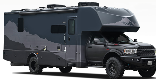
Shown in Xplorer Midnight

Available in Admiral Blue, Granite, Khaki, Magnetic and Merlot. Photos coming soon.