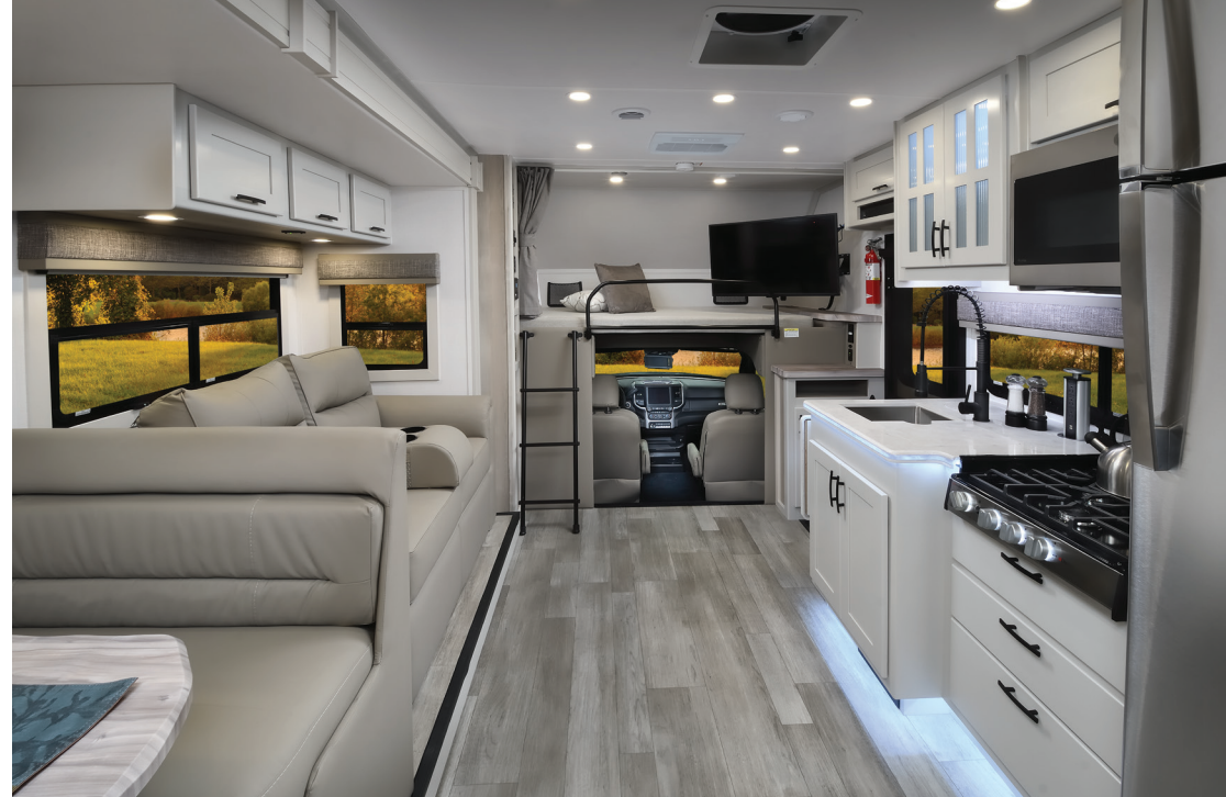
30FW with Mindful Gray cabinetry and Milano II décor