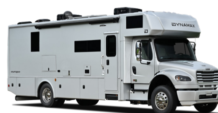
Platinum (Single Color Full Body Paint)